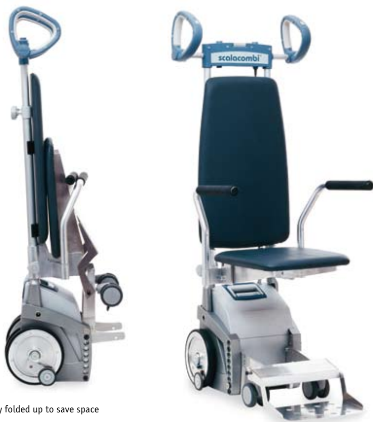
scalacombi: Easily folded up to save space

Thanks to short wheelbase and steerable front wheels it is very manoeuvrable and easy to steer particularly in small rooms or where the staircase is narrow.