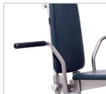
Armrests: Swivel away to make it easier for re-seating