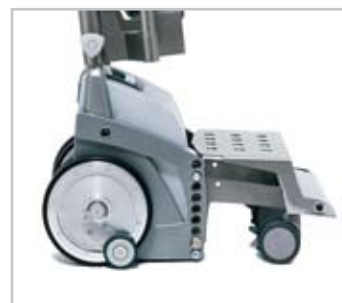
Footrest that folds up making re-seating easier. Ideal for very narrow staircases with confined space